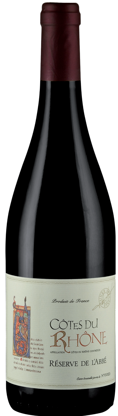
CÔTES DU RHÔNE APPELLATION D'ORIGINE CONTRÔLÉE

The text on the label is a fragmented excerpt from the book of Jeremiah in the old testament that was copied from an early hand painted bible and was chosen for its artwork.